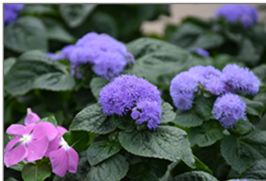
High Tide Blue Flossflower flowers