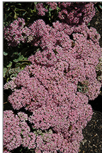
Lime Zinger Stonecrop flowers

This is a relatively low maintenance plant, and is best cleaned up in early spring before it resumes active growth for the season. It is a good choice for attracting bees and butterflies to your yard, but is not particularly attractive to deer who tend to leave it alone in favor of tastier treats. It has no significant negative characteristics.