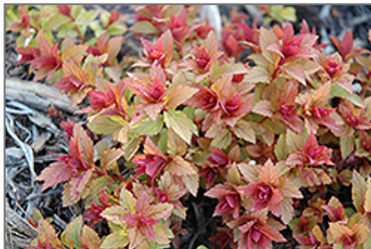
Magic Carpet Spirea foliage

Magic Carpet Spirea will grow to be about 24 inches tall at maturity, with a spread of 3 feet. It tends to fill out right to the ground and therefore doesn't necessarily require facer plants in front. It grows at a fast rate, and under ideal conditions can be expected to live for approximately 20 years.