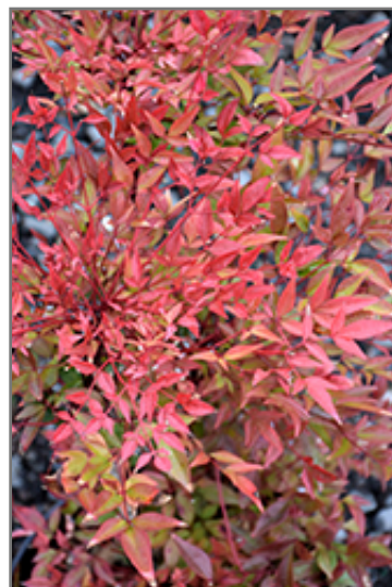
Obsession Nandina foliage