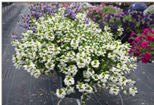
Whirlwind White Fan Flower in bloom