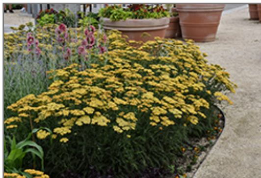
Terra Cotta Yarrow in bloom