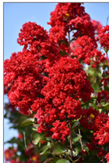
Dynamite Crapemyrtle flowers