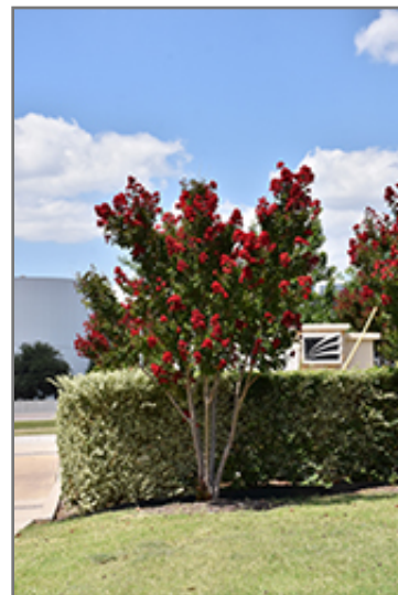
Dynamite Crapemyrtle in bloom