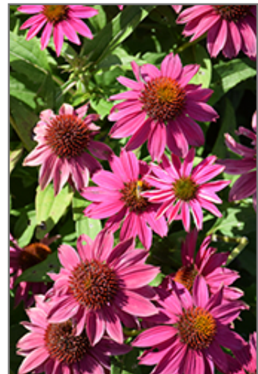
PowWow Wild Berry Coneflower flowers