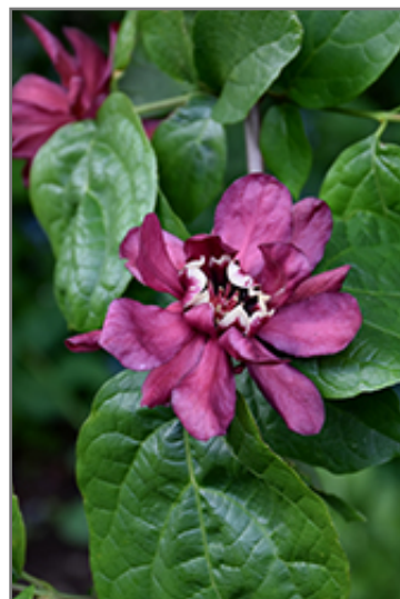
Hartlage Wine Sweetshrub flowers