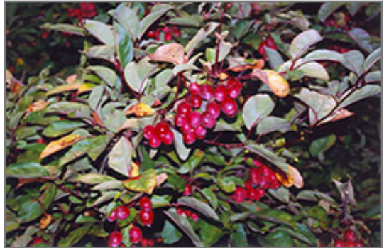
Adams Flowering Crab fruit

This tree should only be grown in full sunlight. It prefers to grow in average to moist conditions, and shouldn't be allowed to dry out. It is not particular as to soil type or pH. It is highly tolerant of urban pollution and will even thrive in inner city environments. This particular variety is an interspecific hybrid.