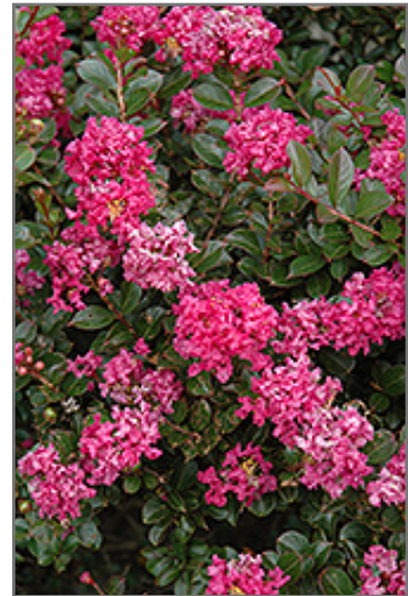
Pocomoke Crapemyrtle flowers

Pocomoke Crapemyrtle is recommended for the following landscape applications;