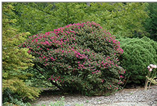
Pocomoke Crapemyrtle in bloom