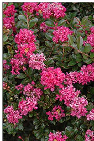
Pocomoke Crapemyrtle flowers

Pocomoke Crapemyrtle is recommended for the following landscape applications;