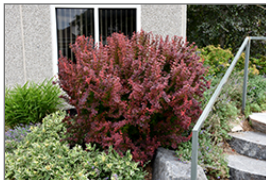
Orange Rocket Japanese Barberry