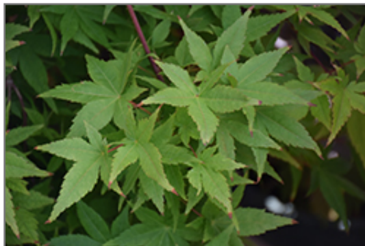
Ryusen Japanese Maple foliage