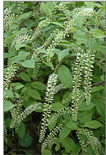
Henry's Garnet Virginia Sweetspire flowers

Henry's Garnet Virginia Sweetspire is recommended for the following landscape applications;