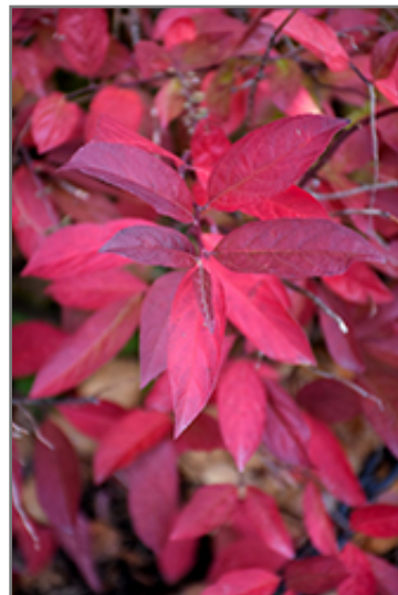
Henry's Garnet Virginia Sweetspire in fall

This shrub performs well in both full sun and full shade. It is an amazingly adaptable plant, tolerating both dry conditions and even some standing water. It is not particular as to soil type or pH. It is somewhat tolerant of urban pollution. This is a selection of a native North American species.