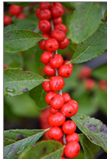
Red Sprite Winterberry fruit

Red Sprite Winterberry is recommended for the following landscape applications;