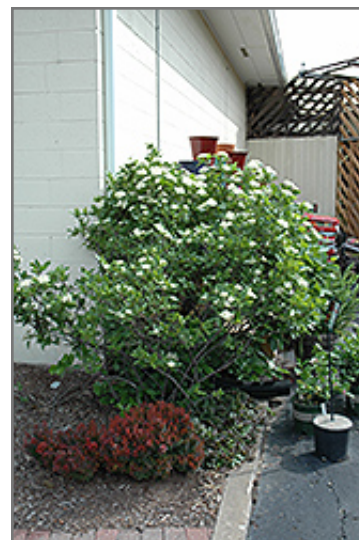
Winterthur Viburnum in bloom