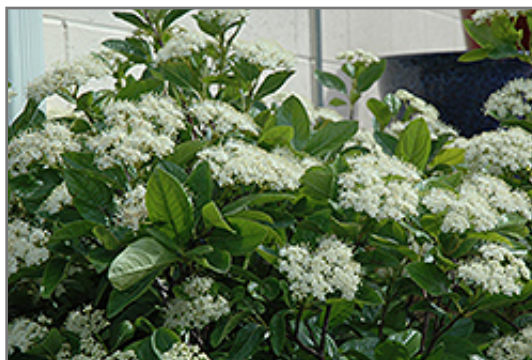
Winterthur Viburnum flowers

This is a relatively low maintenance shrub, and should only be pruned after flowering to avoid removing any of the current season's flowers. It is a good choice for attracting birds to your yard, but is not particularly attractive to deer who tend to leave it alone in favor of tastier treats. It has no significant negative characteristics.