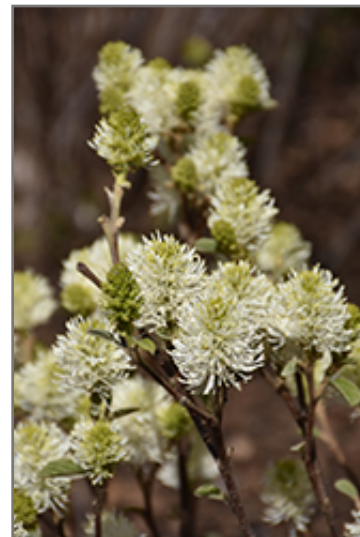
Mt. Airy Fothergilla flowers

Mt. Airy Fothergilla is recommended for the following landscape applications;