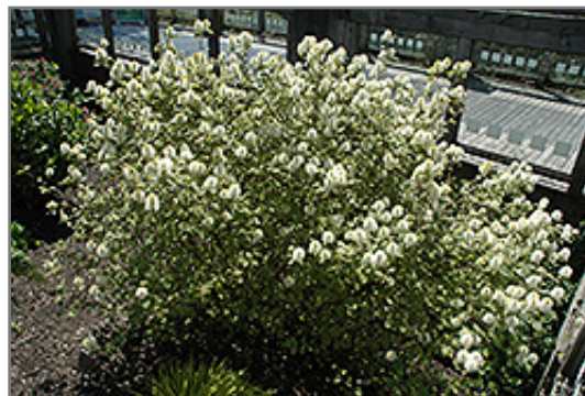
Mt. Airy Fothergilla in bloom