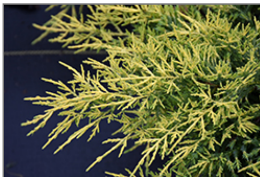
Saybrook Gold Juniper foliage