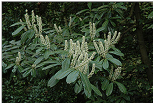
Cherry Laurel flowers

Cherry Laurel is recommended for the following landscape applications;