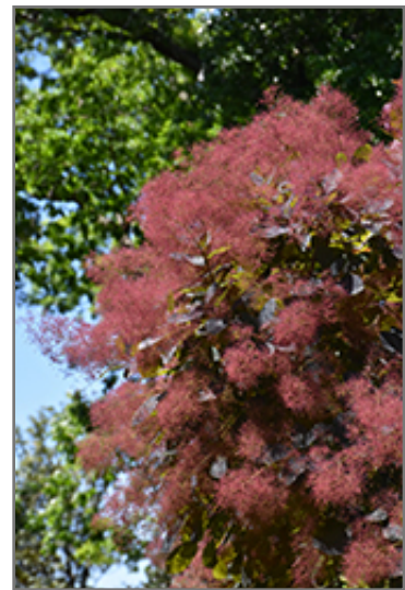
Grace Smokebush flowers