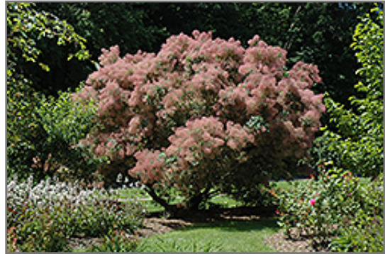
Grace Smokebush in bloom

Grace Smokebush is recommended for the following landscape applications;