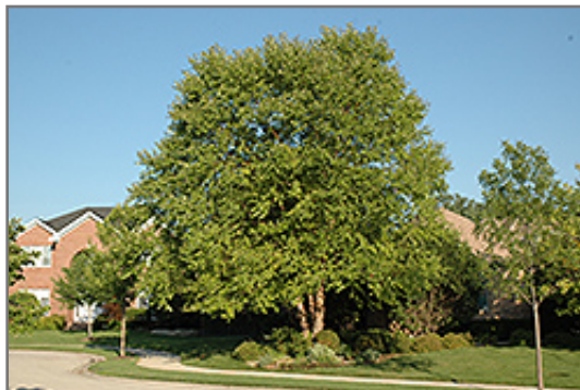
Heritage River Birch