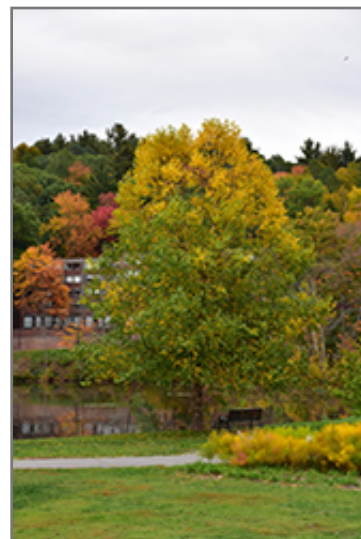
Heritage River Birch in fall

This tree does best in full sun to partial shade. It is quite adaptable, preferring to grow in average to wet conditions, and will even tolerate some standing water. It is not particular as to soil type, but has a definite preference for acidic soils, and is subject to chlorosis (yellowing) of the foliage in alkaline soils. It is highly tolerant of urban pollution and will even thrive in inner city environments. Consider applying a thick mulch around the root zone in winter to protect it in exposed locations or colder microclimates. This is a selection of a native North American species.