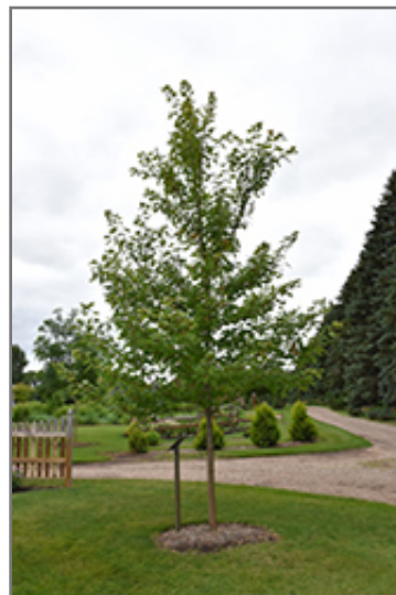
Matador Maple