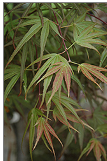
Villa Taranto Japanese Maple foliage