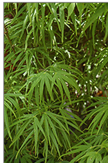
Scolopendrifolium Japanese Maple foliage

Scolopendrifolium Japanese Maple is recommended for the following landscape applications;