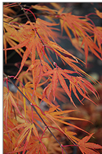
Scolopendrifolium Japanese Maple in fall

Scolopendrifolium Japanese Maple is a fine choice for the yard, but it is also a good selection for planting in outdoor pots and containers. Its large size and upright habit of growth lend it for use as a solitary accent, or in a composition surrounded by smaller plants around the base and those that spill over the edges. It is even sizeable enough that it can be grown alone in a suitable container. Note that when grown in a container, it may not perform exactly as indicated on the tag - this is to be expected. Also note that when growing plants in outdoor containers and baskets, they may require more frequent waterings than they would in the yard or garden.