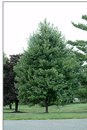
October Glory Red Maple