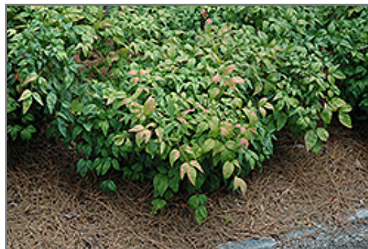
Fire Power Nandina