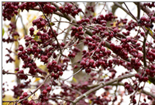
Purple Prince Flowering Crab fruit

This tree should only be grown in full sunlight. It prefers to grow in average to moist conditions, and shouldn't be allowed to dry out. It is not particular as to soil type or pH. It is highly tolerant of urban pollution and will even thrive in inner city environments. This particular variety is an interspecific hybrid.