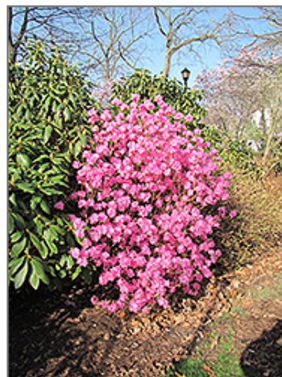
Landmark Rhododendron in bloom