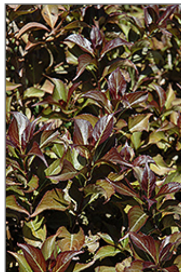
Dark Horse Weigela foliage

Dark Horse Weigela makes a fine choice for the outdoor landscape, but it is also well-suited for use in outdoor pots and containers. Because of its height, it is often used as a 'thriller' in the 'spiller-thriller-filler' container combination; plant it near the center of the pot, surrounded by smaller plants and those that spill over the edges. It is even sizeable enough that it can be grown alone in a suitable container. Note that when grown in a container, it may not perform exactly as indicated on the tag - this is to be expected. Also note that when growing plants in outdoor containers and baskets, they may require more frequent waterings than they would in the yard or garden.