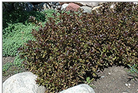
Dark Horse Weigela