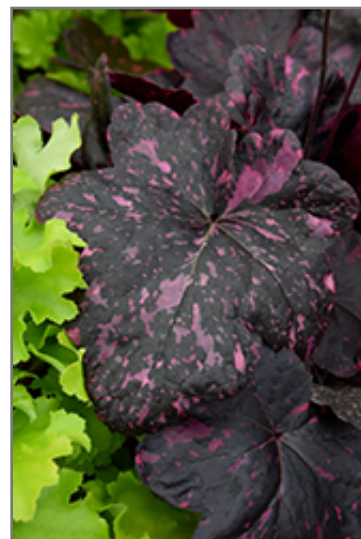
Midnight Rose Coral Bells foliage

Midnight Rose Coral Bells is recommended for the following landscape applications;