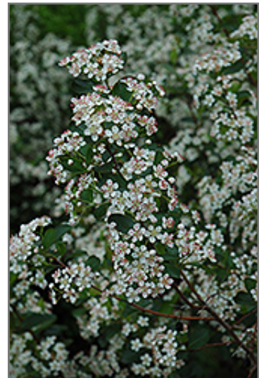
Black Chokeberry flowers