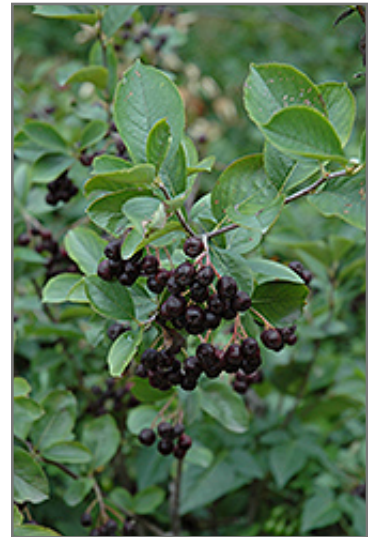
Black Chokeberry fruit