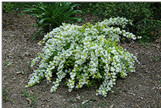
Chardonnay Pearls Deutzia in bloom

Chardonnay Pearls Deutzia is recommended for the following landscape applications;