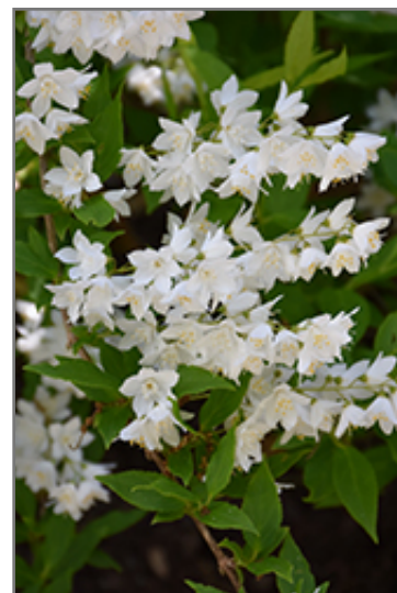
Chardonnay Pearls Deutzia flowers