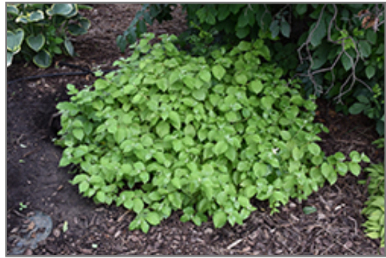
Arctic Sun Dogwood