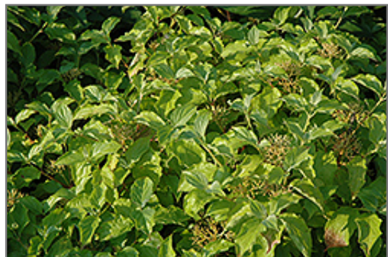
Arctic Sun Dogwood foliage