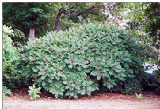
Smooth Sumac in bloom