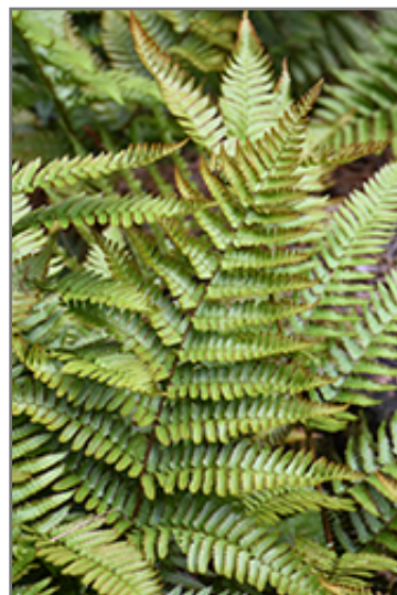
Autumn Fern foliage

Autumn Fern is recommended for the following landscape applications;