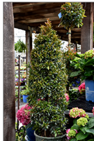
Dwarf Brush Cherry

Dwarf Brush Cherry is recommended for the following landscape applications;