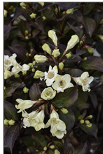
Wine & Spirits Weigela flowers