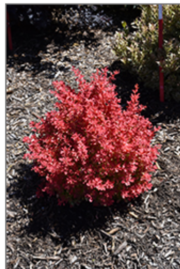
Sunjoy Neo Japanese Barberry

Sunjoy Neo Japanese Barberry makes a fine choice for the outdoor landscape, but it is also well-suited for use in outdoor pots and containers. It can be used either as 'filler' or as a 'thriller' in the 'spiller-thriller-filler' container combination, depending on the height and form of the other plants used in the container planting. It is even sizeable enough that it can be grown alone in a suitable container. Note that when grown in a container, it may not perform exactly as indicated on the tag - this is to be expected. Also note that when growing plants in outdoor containers and baskets, they may require more frequent waterings than they would in the yard or garden.