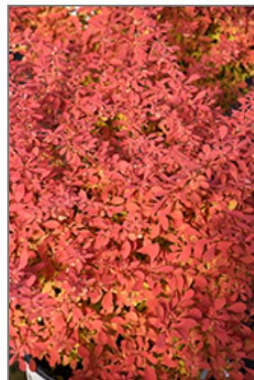
Sunjoy Neo Japanese Barberry foliage

Sunjoy Neo Japanese Barberry is recommended for the following landscape applications;