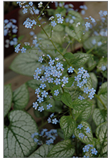
Jack Frost Bugloss flowers