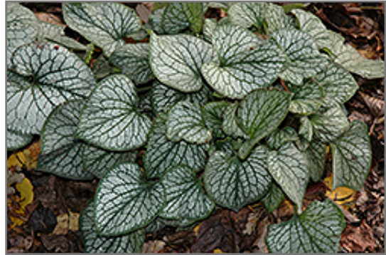
Jack Frost Bugloss foliage

Jack Frost Bugloss is recommended for the following landscape applications;