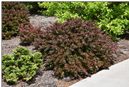
Concorde Japanese Barberry

Concorde Japanese Barberry is recommended for the following landscape applications;