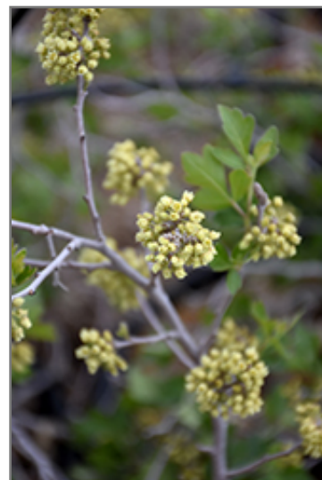
Autumn Amber Creeping Sumac flowers