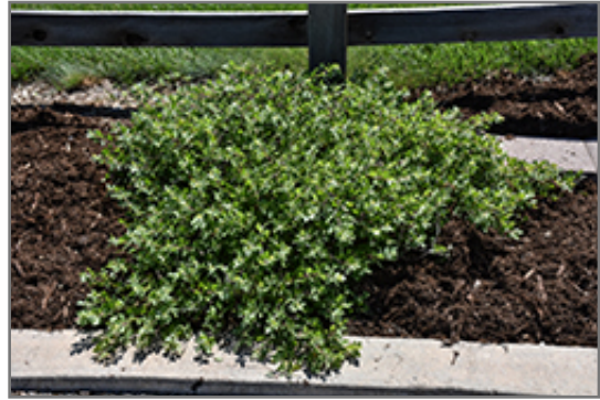
Autumn Amber Creeping Sumac

This shrub does best in full sun to partial shade. It is very adaptable to both dry and moist growing conditions, but will not tolerate any standing water. It is considered to be drought-tolerant, and thus makes an ideal choice for a low-water garden or xeriscape application. It is not particular as to soil type or pH. It is highly tolerant of urban pollution and will even thrive in inner city environments. This is a selection of a native North American species.