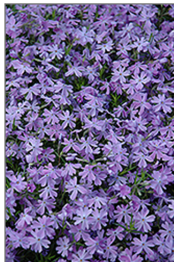
Emerald Blue Moss Phlox flowers