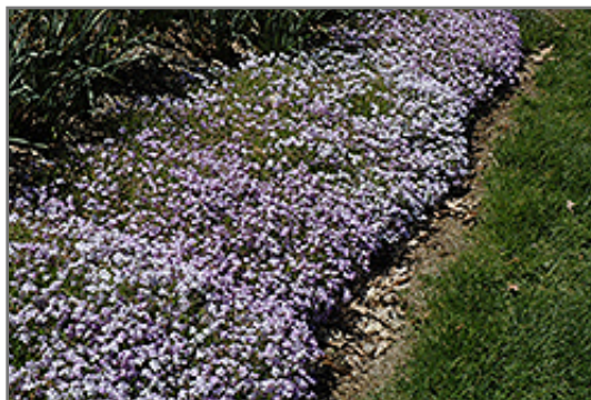
Emerald Blue Moss Phlox in bloom