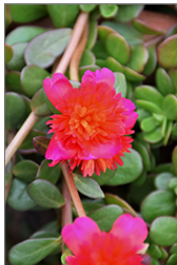
ColorBlast Double Magenta Portulaca flowers

ColorBlast Double Magenta Portulaca is recommended for the following landscape applications;