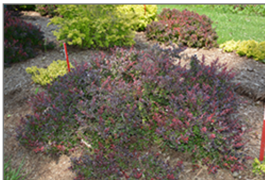
Sunjoy Todo Japanese Barberry

Sunjoy Todo Japanese Barberry will grow to be about 24 inches tall at maturity, with a spread of 24 inches. It tends to fill out right to the ground and therefore doesn't necessarily require facer plants in front. It grows at a medium rate, and under ideal conditions can be expected to live for approximately 20 years.