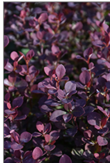
Sunjoy Todo Japanese Barberry foliage