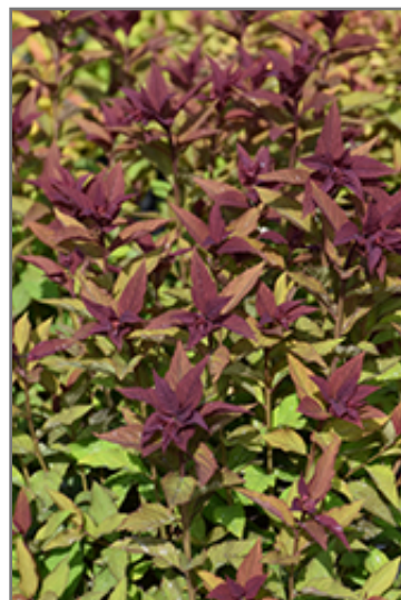
Double Play Doozie Spirea foliage

This shrub should only be grown in full sunlight. It prefers to grow in average to moist conditions, and shouldn't be allowed to dry out. It is not particular as to soil type or pH. It is highly tolerant of urban pollution and will even thrive in inner city environments. This particular variety is an interspecific hybrid.