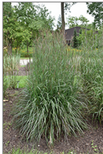
Blackhawks Bluestem in bloom