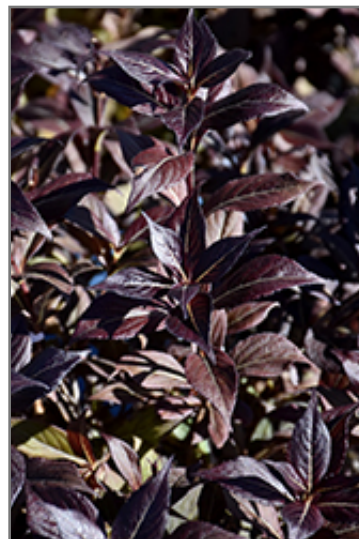
Date Night Stunner Weigela foliage