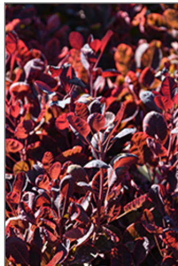
Velveteeny Purple Smokebush foliage

Velveteeny Purple Smokebush makes a fine choice for the outdoor landscape, but it is also well-suited for use in outdoor pots and containers. With its upright habit of growth, it is best suited for use as a 'thriller' in the 'spiller-thriller-filler' container combination; plant it near the center of the pot, surrounded by smaller plants and those that spill over the edges. It is even sizeable enough that it can be grown alone in a suitable container. Note that when grown in a container, it may not perform exactly as indicated on the tag - this is to be expected. Also note that when growing plants in outdoor containers and baskets, they may require more frequent waterings than they would in the yard or garden.