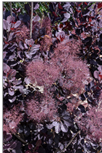
Velveteeny Purple Smokebush flowers