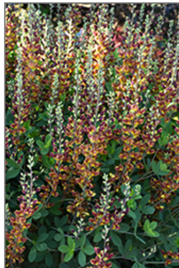
Decadence Cherries Jubilee False Indigo flowers

Decadence Cherries Jubilee False Indigo is a fine choice for the garden, but it is also a good selection for planting in outdoor pots and containers. With its upright habit of growth, it is best suited for use as a 'thriller' in the 'spiller-thriller-filler' container combination; plant it near the center of the pot, surrounded by smaller plants and those that spill over the edges. It is even sizeable enough that it can be grown alone in a suitable container. Note that when growing plants in outdoor containers and baskets, they may require more frequent waterings than they would in the yard or garden.