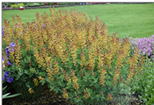
Decadence Cherries Jubilee False Indigo in bloom