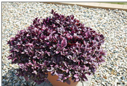
Purple Prince Alternanthera

Purple Prince Alternanthera will grow to be about 14 inches tall at maturity, with a spread of 20 inches. When grown in masses or used as a bedding plant, individual plants should be spaced approximately 14 inches apart. Its foliage tends to remain dense right to the ground, not requiring facer plants in front. Although it's not a true annual, this fast-growing plant can be expected to behave as an annual in our climate if left outdoors over the winter, usually needing replacement the following year. As such, gardeners should take into consideration that it will perform differently than it would in its native habitat.